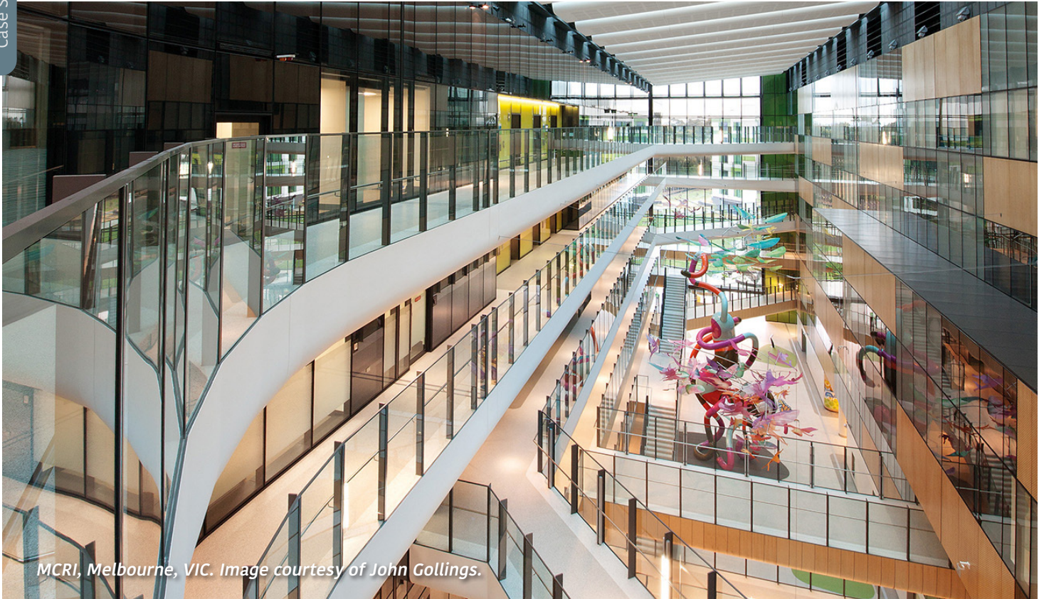
MCRI, Melbourne, VIC.

In the end, MCRI selected a best of breed solution from XENON which included: