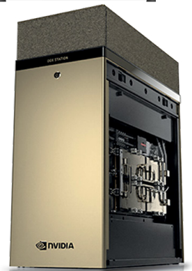
▲ NVIDIA DGX POD and NVIDIA DGX Station A100