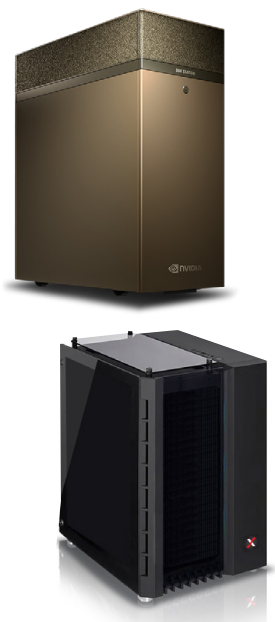
▲ NVIDIA DGX Station and XENON DevCube

A starting point for researchers is to begin with a single GPU workstation, such as the DGX Station™ or XENON DevCube, and use it to test models to show the promise of a theory, using early success to obtain funding to step up their compute power. These GPU workstations provide a data centre at the desk, with incredible processing power available with standard power and ambient cooling making them ideal for individuals and small teams. As theories are proven and compute requirements grow requiring larger data sets and more processing to take the research to the next level, the containerisation of the NVIDIA software stack makes it simple to scale up into the next DGX System. The same base